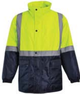
FLUORESCENT YELLOW (601) /NAVY (300)