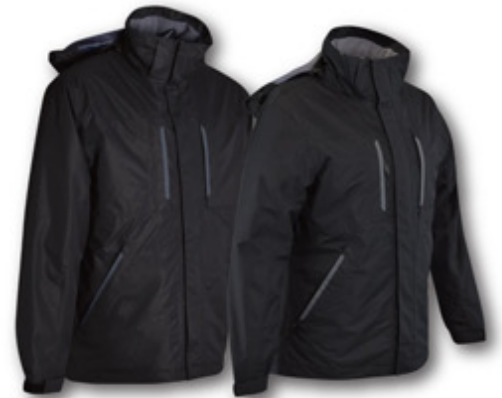
BLACK (100) / GRAPHITE (201)