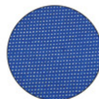
ROYAL (301)/WHITE (000)