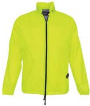
FLUORESCENT YELLOW (601)