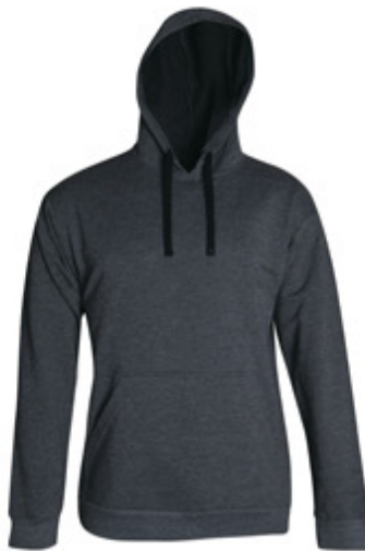
CHARCOAL MELANGE (206)