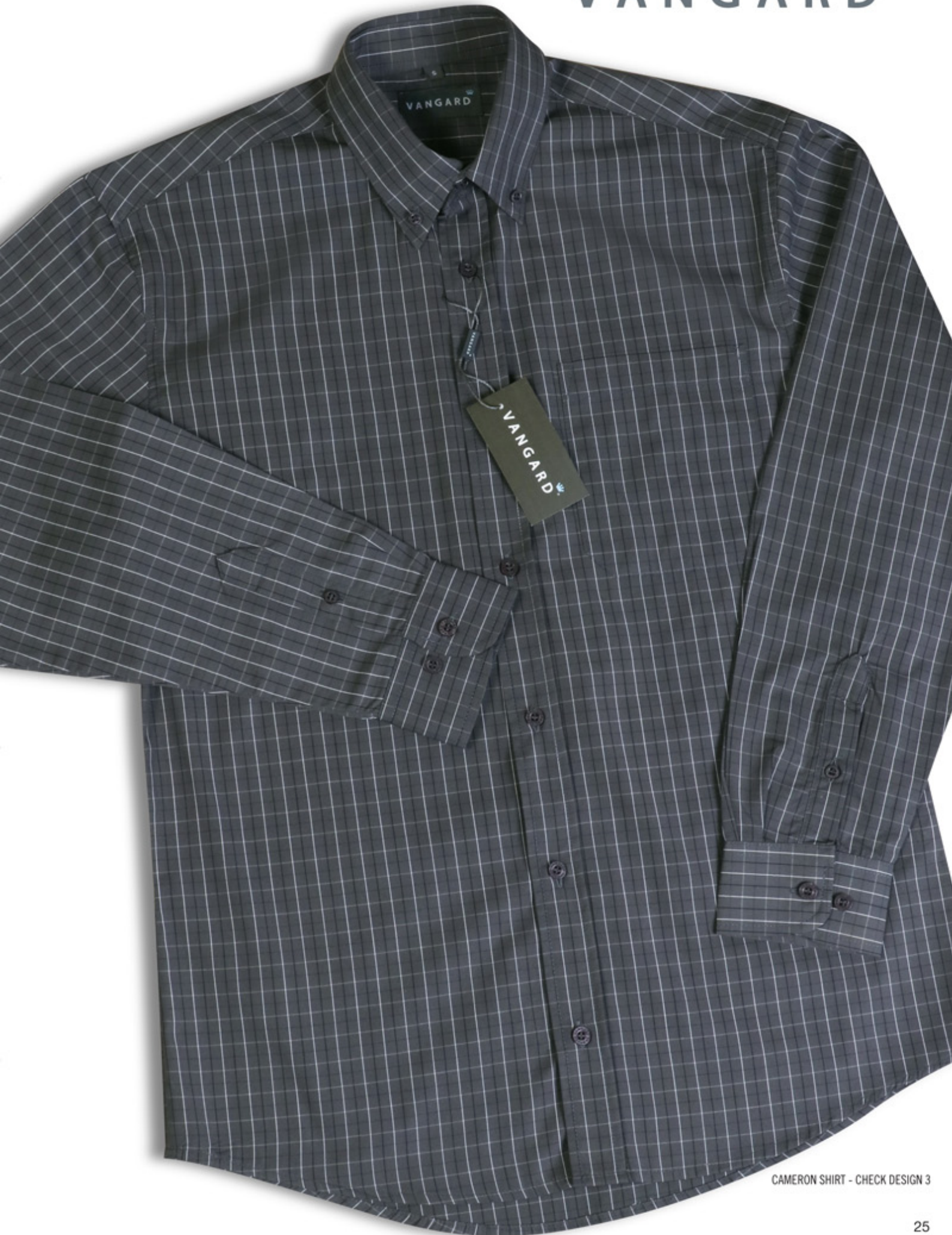
CAMERON SHIRT - CHECK DESIGN 3