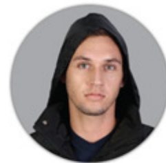
ZIP AWAY HOOD