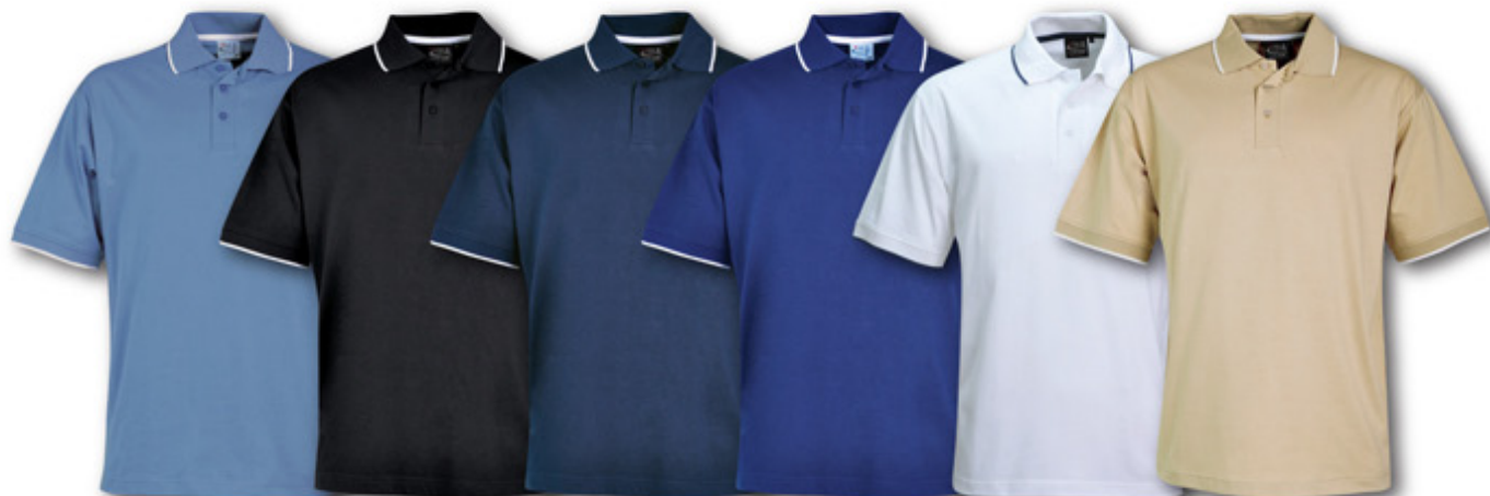
STONE (801)/ WHITE (000)