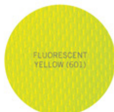
FLUORESCENT YELLOW (601)