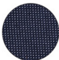
NAVY (300)/WHITE (000)