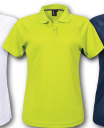
BRIGHT LIME (406)