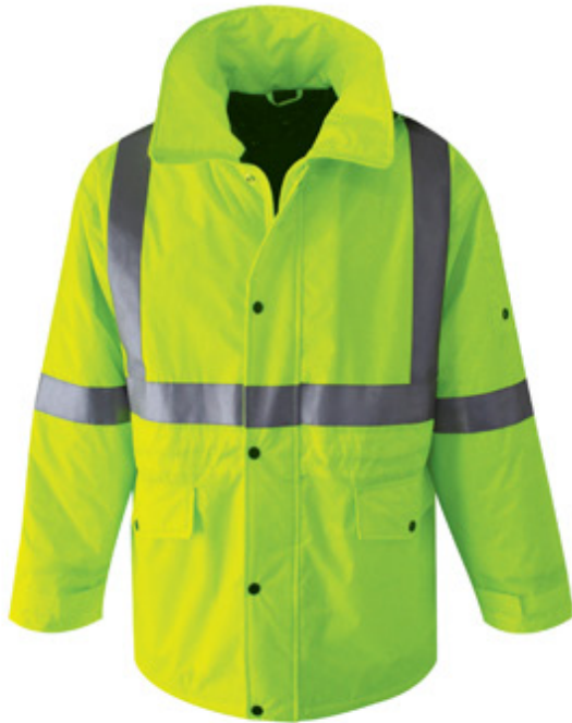
FLUORESCENT YELLOW (601)