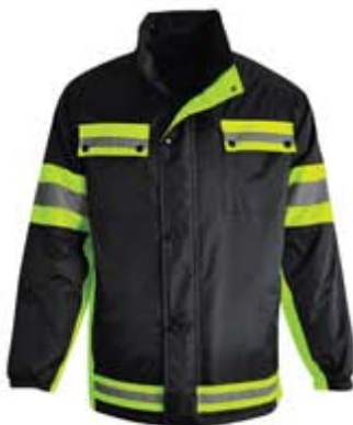
BLACK (100)/ FLUORESCENT YELLOW (601)

MATCHING HIGH VIS CAPS AVAILABLE - PAGE 85