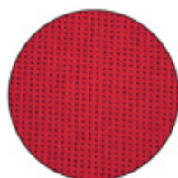
RED (200)/BLACK (100)