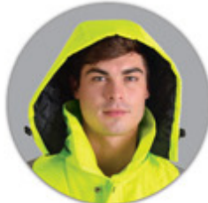
ZIP AWAY HOOD