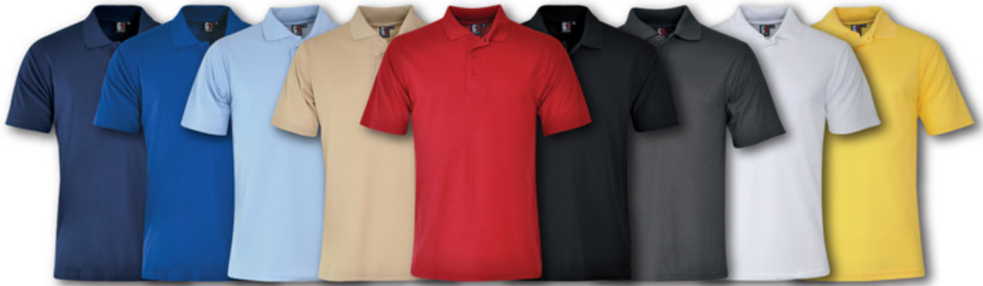
NAVY (300) ROYAL (301) SKY (306) BEIGE (800) RED (500) BLACK (100) SLATE GREY (200) WHITE (000) YELLOW (600)