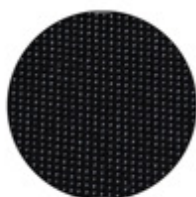
BLACK (100)/WHITE (000)