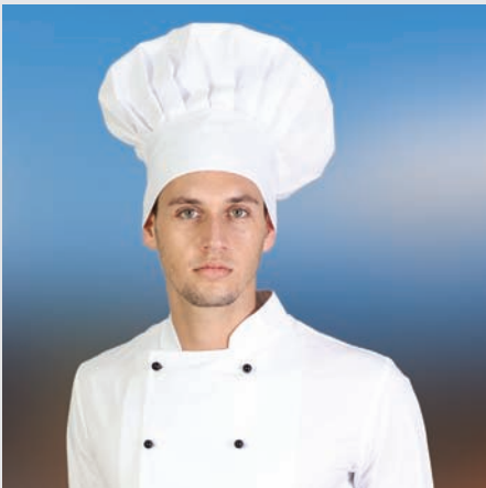
75 | STANLEY CHEF JACKET