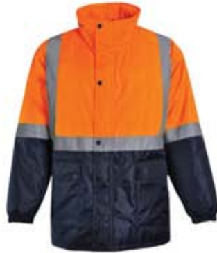
FLUORESCENT ORANGE (701) /NAVY (300)