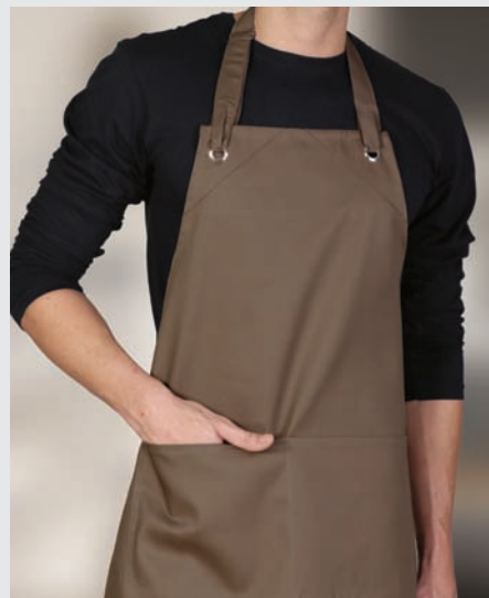
73 | UTILITY APRON