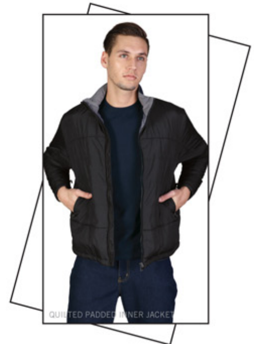
QUILTED PADDED INNER JACKET