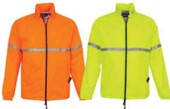
FLUORESCENT ORANGE (701)