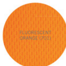
FLUORESCENT ORANGE (701)