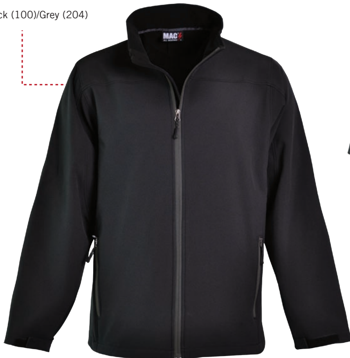
Black (100)/Grey (204)